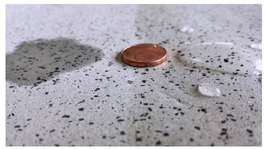
Left: unprotected - water penetrates the surface Right: protected with COLORFRESH® intensiv - water is repelled