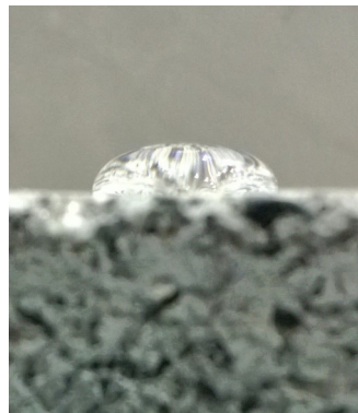
Right: protected with COLORTEC® MAX

More pictures of protected concrete surfaces can be found in our online photo gallery .