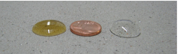
Protected with COLORTEC® MAX , left oil, right water

Videos with "repelling" effects of COLORTEC® can be found in our online video gallery .