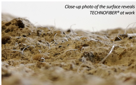
Close-up photo of the surface reveals TECHNOFIBER® at work